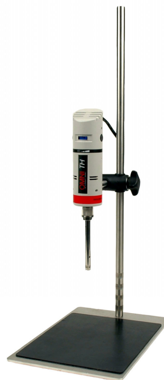
Omni TH shown with optional motor stand assembly and stainless steel probe.

The Omni Tissue Homogenizer operates with Omni Tip™ disposable/reusable plastic probes or stainless steel generator probes.